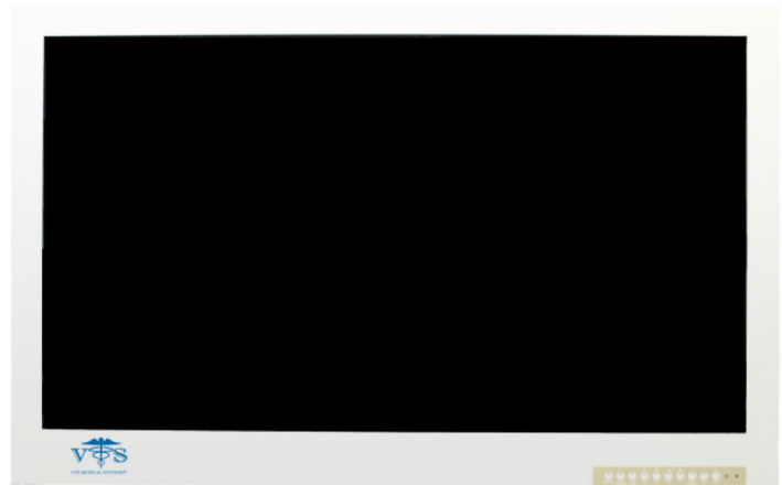
VividImage® 42" Wide Screen Monitor