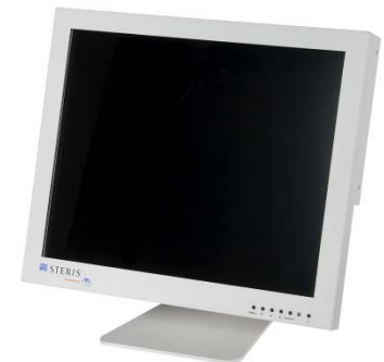
19 inch Optical Touch

Please note: The Operation Manual for this monitor can be downloaded from www.vtsmedical.com . Click on PRODUCTS, then DOCUMENTATION, find the monitor's part number in the table then click the DOWNLOAD icon.