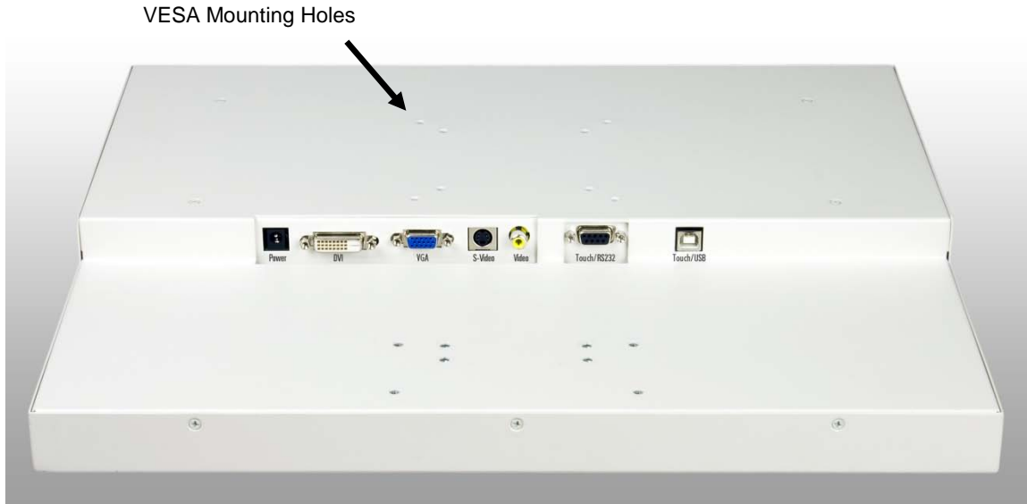
Figure 1: VividImage® Monitor Rear View